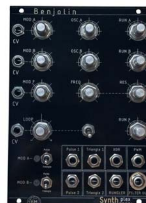
Close-up of the Buck Modular board & complete module (minus knobs).